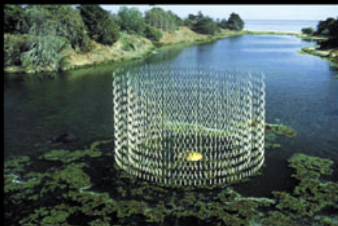
ATOLL, 1990 University Art Museum, University of Santa Barbara, CA