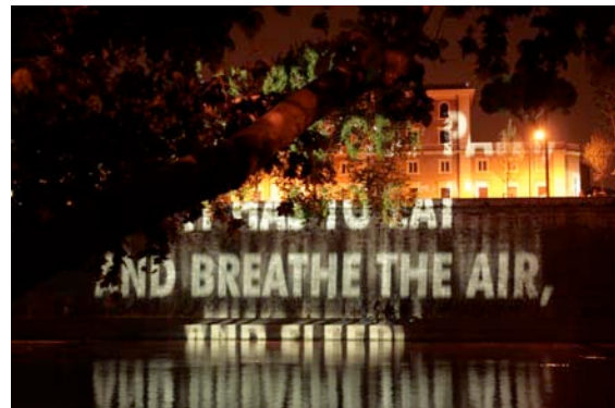
Fig. 13: Jenny Holzer, 'For the Academy' (2007), Piazza Tevere, Rome.

Synchronized, scrolling projections of texts by international poets and writers, in both English and Italian, were cast along the 1800-foot length of the Piazza Tevere's right bank over the course of the evening. Viewers gathered on the river piazza's banks, parallel walkways and bridges from 9pm to 12am during the first event of Tevereterno's 2007 programming.