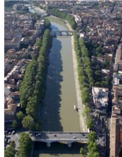
Fig. 7b: Aerial View of Piazza Tevere. Alex S. MacLean.