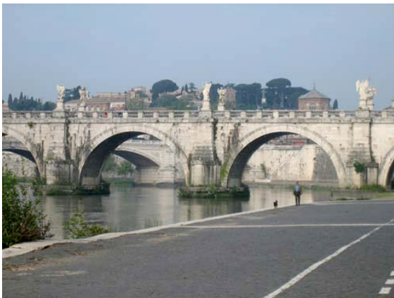
Fig. 6: Tiber River near the Vatican. Kay Bea Jones.

Yet there is plenty of life along the Tiber. The Roman pedestrian feels relief from the crowded streets with each bridge crossing. Seasonal changes are pleasant as leaves turn color, then fall, and skies open providing brighter areas and open vistas within the densely built fabric of the city. At night the moon can be seen reflecting on the water surface. For being in the center of Rome, the Tiber quays are not particularly polluted or unsafe, even though they currently accommodate primarily the socially marginal and infrequent joggers, dog walkers, and fisherman. The overgrown green fringes along the river's edge remain largely uninhabited; they are more visually than physically accessible.