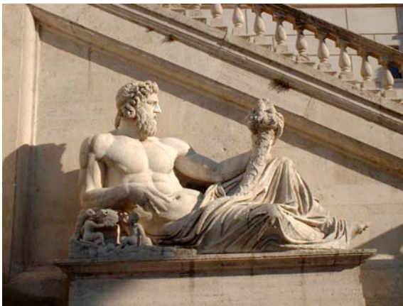
Fig. 3: The Tiber God at the Campidoglio. Kristin Jones.

Another familiar figure is the personification of the river itself as a male river god. At the base of the Campidoglio's Senate Palace resides a gigantic statue, reclining at the feet of the goddess Roma and holding a cornucopia of abundance. He originates in the myth of the legendary king, Tiberinus Silvius or Thebris, from Alba Longa who was to have drowned in the local Albula River, thus the river was renamed the Tiber in his honor, (Tiberis in Latin; Tevere in Italian). The previous pre-Indo-European name for the river was associated with "alba", the white color of the river caused by sediment that continues to be the source of its creamy, opaque appearance. According to myth, Roma, goddess of Rome, then called on the god Voltumnus, named for "rolling water," as the guardian spirit of the river to ward off future mishaps.