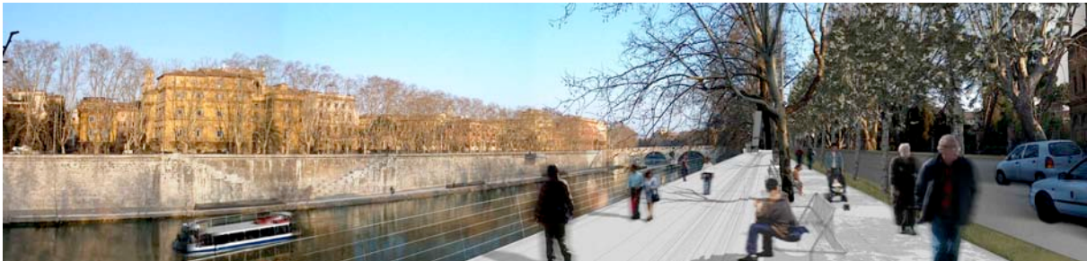
Fig. 8: Proposed view of the Piazza Tevere site from the Lungotevere as envisioned in the 2004 Master Plan for Rome.

Jones's proposal for riverfront seating along the Viale Lungotevere, is as natural to Rome as the bench along the front of Palazzo Farnese. The proposal's most radical intervention constitutes an erasure rather than an addition of a monumental new structure. By removing the one-meter tall continuous stone wall from the upper avenue, visual connection would be established between the city above and the river below. One hears echoes of Colin Rowe, who staged "Roma Interotta" during the era of paper architecture. To revisit the spatial complexity of the Eternal City, Rowe invited hypothetical interventions sited on the 1748 Nolli map by renowned architects, thereby inciting an urban orgy of postmodern critical introspection. Yet when Rowe defined the ideal city as a place accommodating the "theater of memory" and the "theater of prophecy," he might as well have been describing Jones's waterfront theater proposal. As a continuation of the surrounding civic environment, Rome's new cultural venue would host performances by renowned and emerging artists along with those of the everyday actors and passerby.