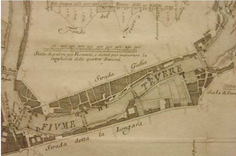
Fig. 7a: Tiber River between Ponte Sant'Angelo and Ponte Sisto, detail from A. Chiesa, Pianta del Corso del Tevere e sue adiacenze , 1744. Delineata da Andrea Chiesa e Bernardo Gambarini, (Rome: 1744).