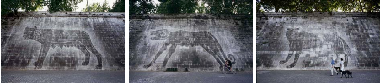
Figs. 9a-9c: She-wolves and Roman pedestrians on the banks of the Tiber.