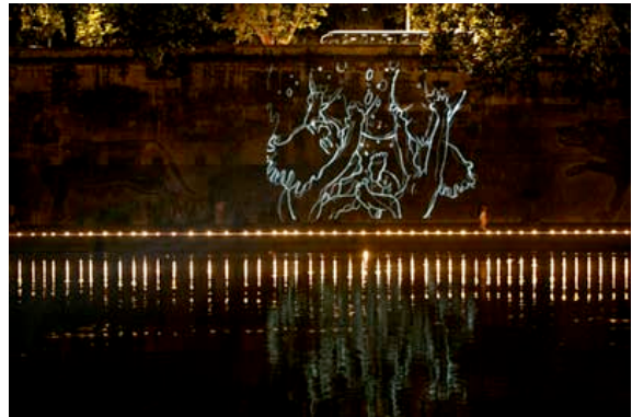
Fig. 14: Maureen Selwood, 'At the River's Edge' (2006), Piazza Tevere, Rome.

Tevereterno's inaugural solstice event at the Piazza Tevere lit the banks of the Tiber River with 2,758 fiaccole , outlining the site and representing the years since the founding of Rome. Twelve grand She-Wolf silhouettes (height: 24ft / 8m) revealed by cleaning the patina of time from the embankment walls were unveiled, and a 100-member harmonic international choir directed by Roberto Laneri performed over the course of the night.