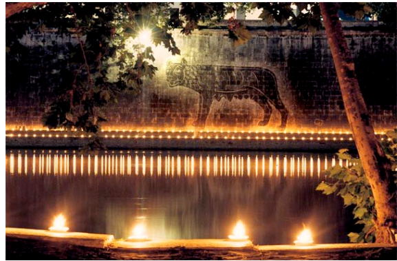
Fig. 15: Kristin Jones, 'She-Wolves' (2005), Piazza Tevere, Rome.